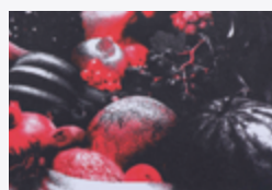
Printed by previous models