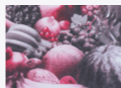
Printed by the RISO MH series