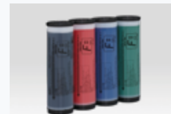
RISO INK FIL TYPE Color (1000 ml)

The RISO iQuality mark indicates a RISO product compatible with the RISO iQuality System.