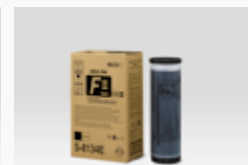
RISO INK FIL TYPE HD BLACK (1000 ml)