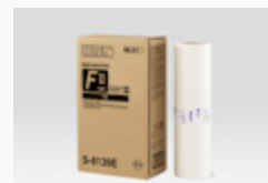
RISO MASTER FIL TYPE HG97 RISO MASTER FIL TYPE HD87 (A3: 220 sheets)