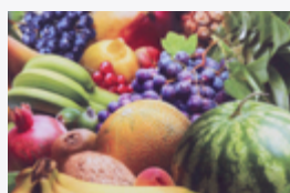
Photo document (original before scanning)

The MH series has achieved higher photo quality in scanning. When scanning a document with photos, it provides beautiful two-color separation of the photos and smooth tonal gradation even with photo images. In addition, equalized dot description reduces blown-out highlight areas.